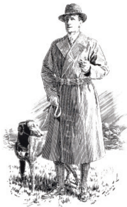
ILLUSTRATION OF THE BURBERRY TIELOCKEN WHICH WAS PATENTED IN 1912